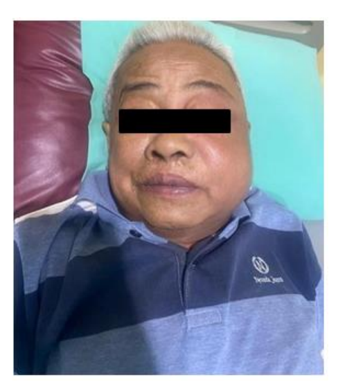
Clinical photograph showing swelling of the submaxilla sinistra