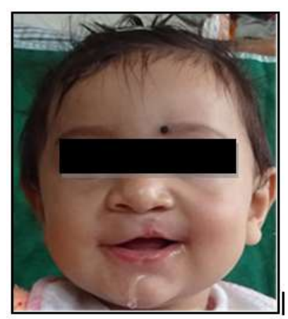
Fig-4: Post-Operative Frontal View