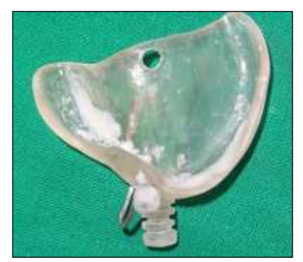
Fig-2: NAM Appliance