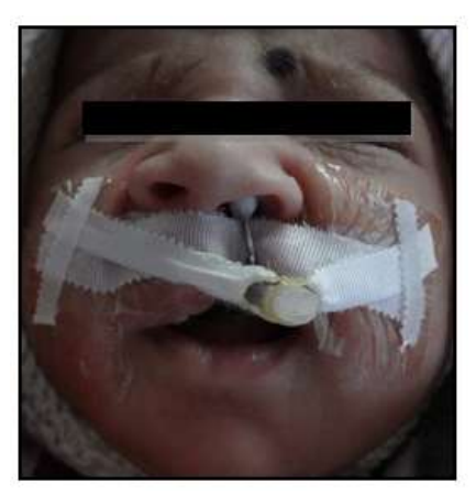
Fig 3: Lip Taping and Appliance Insertion