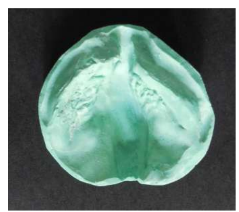
Fig-6: Post-Operative Cast Model