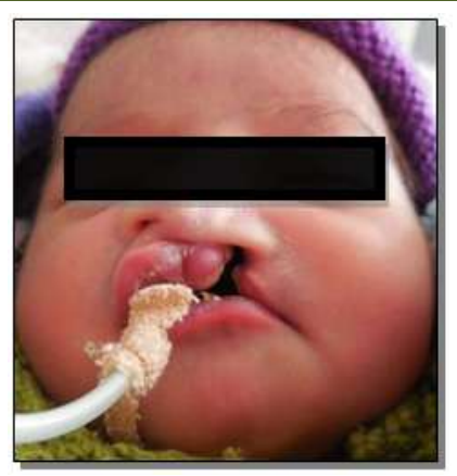
Fig-1: Preoperative Frontal View

The PNAM appliance fabrication and steps involved the impression making using elastomeric impression material, (Addition silicone- 3M) in putty consistency. A dental stone cast was obtained and wax- up of the cast was done according to the contour and topography of the intact arch as per the Figueroa's PNAM technique, before the fabrication of the moulding plate. The moulding plate was fabricated using self- cure clear acrylic on the waxed up cast. A nasal stent was added at the same time of fabrication of moulding plate (Fig 1-6). The complete appliance was delivered and the patients were recalled initially after 24 hr to check for problem due to appliance and later every 3-4 weeks for adjustments till primary cheiloplasty. Adjustments in the appliance was done using selective grinding and addition of soft denture liner.