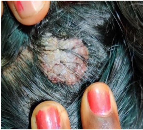
Fig-1: 2x2 cm sized verrucous nodule on right side parietal area of scalp

Case 2: A 20 year old male patient of pemphigus vulgaris presented with single asymptomatic well defined, nodular lesion sized 4x 5 cm on scalp. Patient noticed the lesion since 1 year. The lesion was firm in consistency and was skin colored.