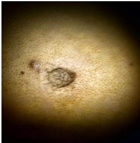
Fig-7: 1x2 cm sized well defined nodule over right parietal area of scalp

Case 6: A 14 old year male patient presented with single asymptomatic lesion over occipital area of scalp, present since birth. The lesion was flat initially; it increased in size in past few months to develop into a verrucous, firm nodule 1x2 cm in size.