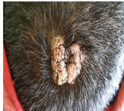
Fig-5: 3x 4 cm size well defined, verrucous plaque over right parietal area of scalp

Case 4: A 28 year old male patient presented with well defined, verrucous plaques of size 3x 4 cm over right parietal region of scalp. As per the history, the lesion was present since birth as yellow- orange, velvety plaque of size 1x2 cm. It had rapidly increased in size, grew thicker in past 10 years. A diagnosis of post pubertal nevus sebaceous was made. Patient came for excision for cosmetic purposes and excision biopsy was done. Biopsy findings were suggestive of nevus sebaceous of Jadassohn.