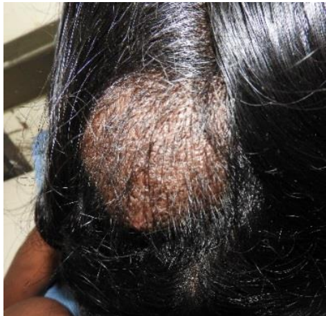
Fig-2: 4x 5 cm sized well defined skin colored nodule over occipital area of scalp

Case 2: A 20 year old male patient of pemphigus vulgaris presented with single asymptomatic well defined, nodular lesion sized 4x 5 cm on scalp. Patient noticed the lesion since 1 year. The lesion was firm in consistency and was skin colored.