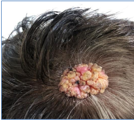
Fig-6: 2x2 cm sized skin colored, well defined, verrucous, nodule over parietal area of scalp

Case 6: A 14 old year male patient presented with single asymptomatic lesion over occipital area of scalp, present since birth. The lesion was flat initially; it increased in size in past few months to develop into a verrucous, firm nodule 1x2 cm in size.