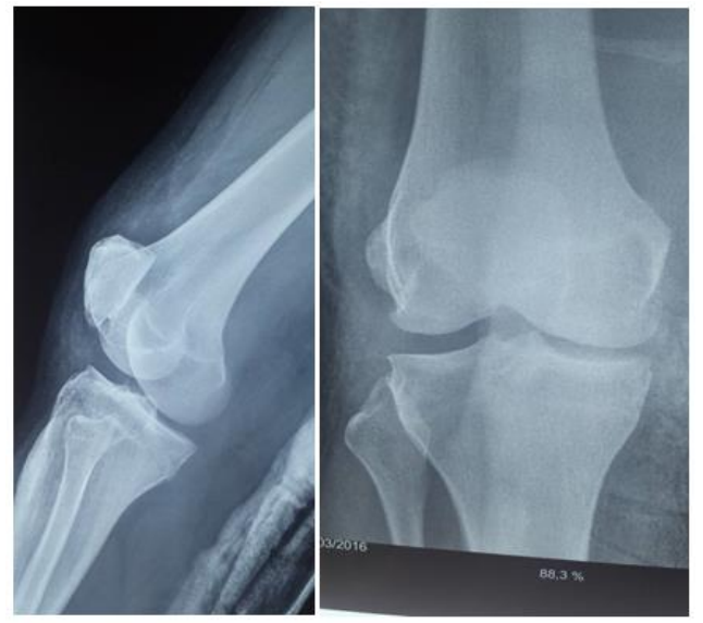
Fig-3: Radiological control after reduction of dislocation