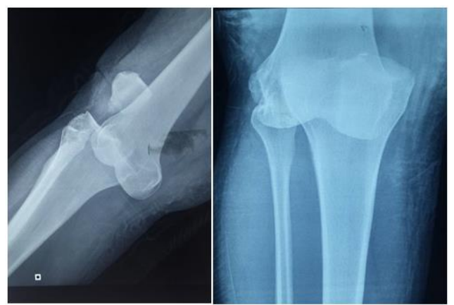
Fig-2: Radiography of knee dislocation