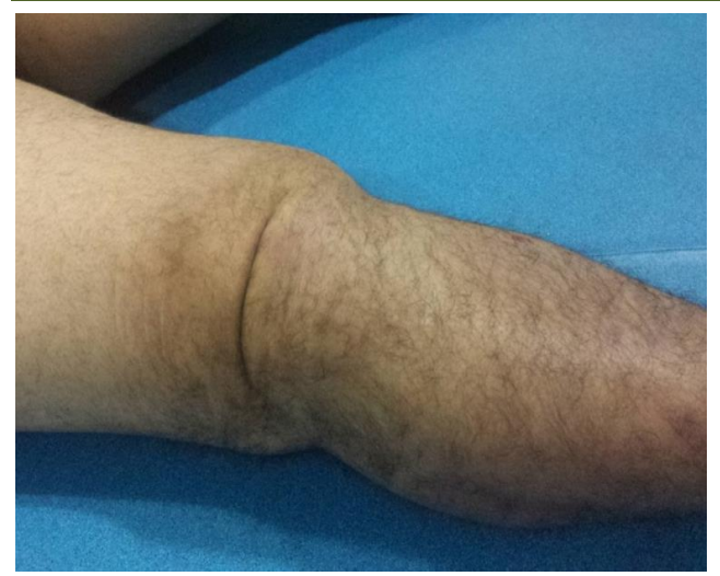
Fig-1: Clinical image of knee dislocation