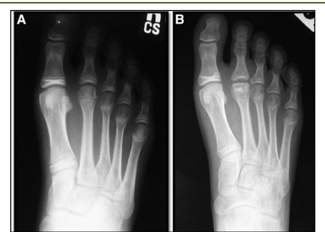
Fig-1: (A) on the initial assessment, the x-ray was normal (B) a year later, the flattening of the metatarsal head is easily apparent