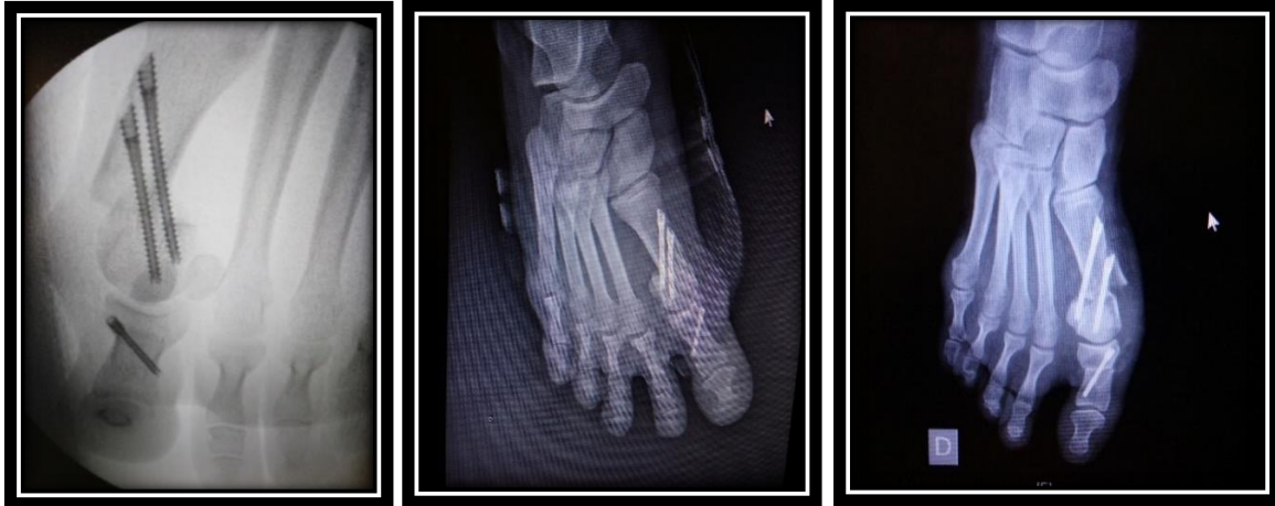
Fig-2: Post operative X-ray (face): First metatarsal chevron percutaneous osteotomy