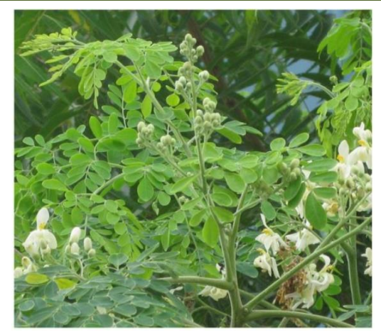
Fig-1: Image of Moringa Oleifera