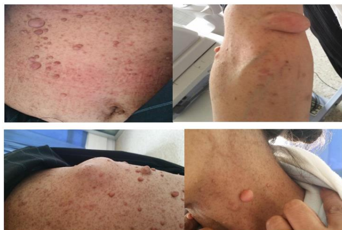
Fig-2: Multiple neurofibromas with milk coffee stains

The brain scan is performed in search of a glioma of the optic nerve, The dosage of catecholamines and metanephrines are normal. She has had several surgical ablations of neurofibromas. The social and psychological impact is very important, the patient refuses to marry, and is always struggling to find a job.