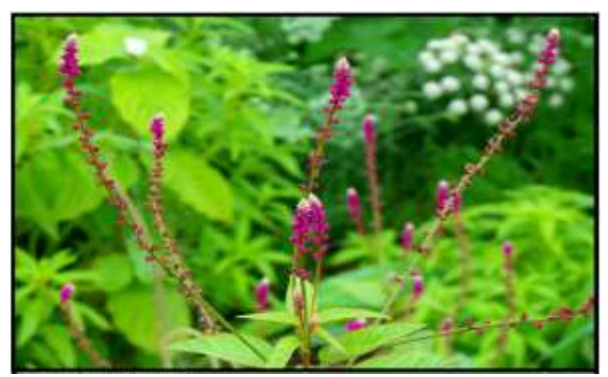
Fig-1: Flower of Digera muricata Table 3: Scientific Classification of Digera muricata