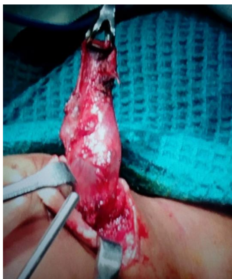
Fig-2: Following dissection of the mass from the surrounding tissue.