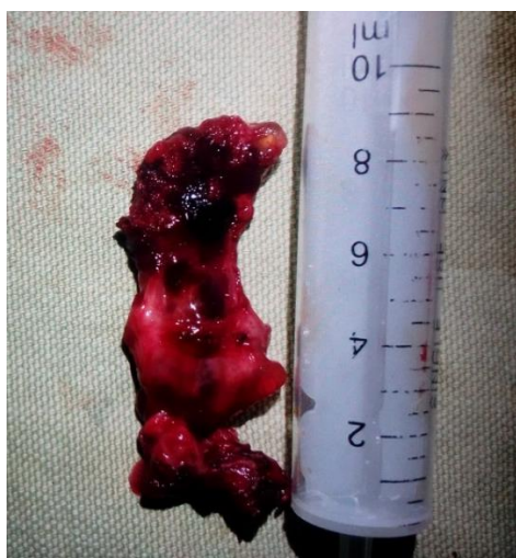
Fig-3: Excised specimen.