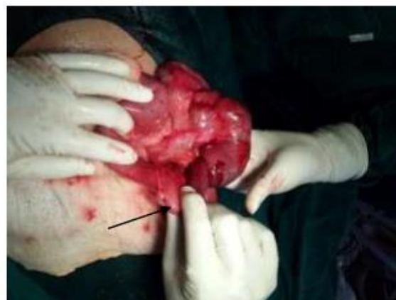
Fig-2: On partial reduction of intussusception buried Meckel's diverticulum with band was visualised