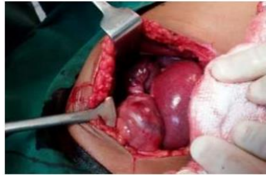
Fig-5: Intra operative picture of twisted meckels diverticulitis attached to dome of urinary bladder

A 16 year old male patient presented to emergency with abdominal pain, distension and vomiting since 3 days. Examination findings including ultrasound and erect X- ray abdomen were suggestive of acute intestinal obstruction. Patient was taken up for emergency exploratory laparotomy, which revealed an intestine like rotated tissue obstructing and strangulating ileum in right iliac fossa, that twisted coil was ending on the dome of bladder which on further exploration showed a blind Meckel's diverticulitis getting adherent to the dome of urinary bladder. This adherent Meckel's diverticulum was acting as a pivot for the coils to rotate around. Part of diverticulum adherent to the bladder was dissected and diverticulectomy was done along with derotation. Post - operative period was uneventful.