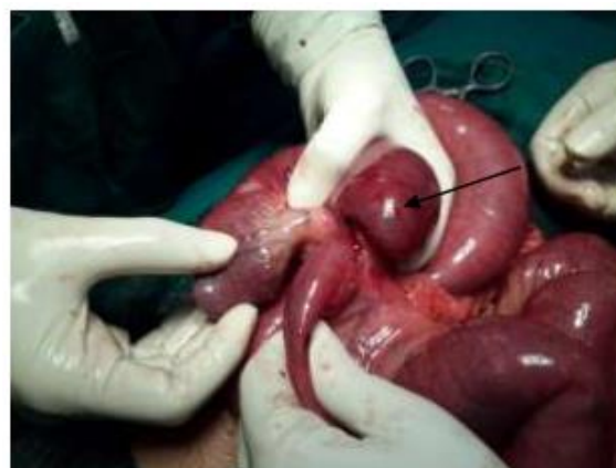
Fig-1: Ileo- ileal intussusception

4 episodes. Pain was colicky type. On examination vitals were within normal limits, abdominal distension was present with increased bowel sounds (Borborygmi). A clinical diagnosis of intestinal obstruction was made and confirmed by plain erect X-ray abdomen (showed multiple air fluid levels) and ultrasound abdomen (was in favour of ileo-ileal intussusception). Diagnosis of small bowel obstruction was made and on laparotomy ileo-ileal intussusception with gangrenous bowel was noted, which on reduction showed a Meckel's diverticulum which in turn was acting as a lead point for intussusception. Resection and anastomosis of the gangrenous bowel involving a Meckel's diverticulum was done. Post-operative period was uneventful.