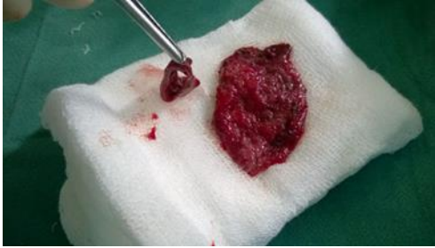
Fig-8: Opened meckel's diverticulum with variegated mucous membrane