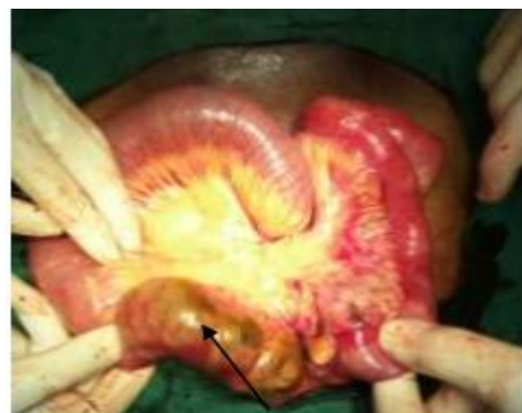
Fig-12: Gangrenous bowel