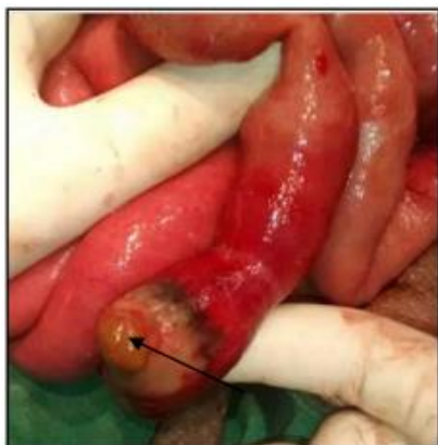
Fig-9: Incarcerated meckels diverticulum with necrosed tip

Inguinal incision was taken which was later converted into lower paramedian incision. A large direct hernia sac (pseudo sac) was dissected revealing a Meckel's diverticulum approximately 4 cm in length which was incarcerated and apex was necrosed. There was a posterior wall defect of 2×1 cm through which herniation of Meckel's diverticulum occurred. The diverticulum along with gangrenous ileal segment was resected and end to end anastomosis done with single layered suturing, the hernia was repaired without complication. Post-operative period was uneventful and discharged on post-operative day seven.