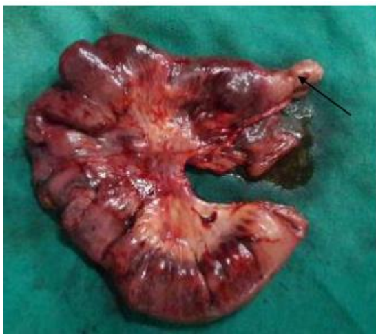
Fig-4: Meckel's Diverticulum

Resected specimen of gangrenous ileum along with Meckel's diverticulum.