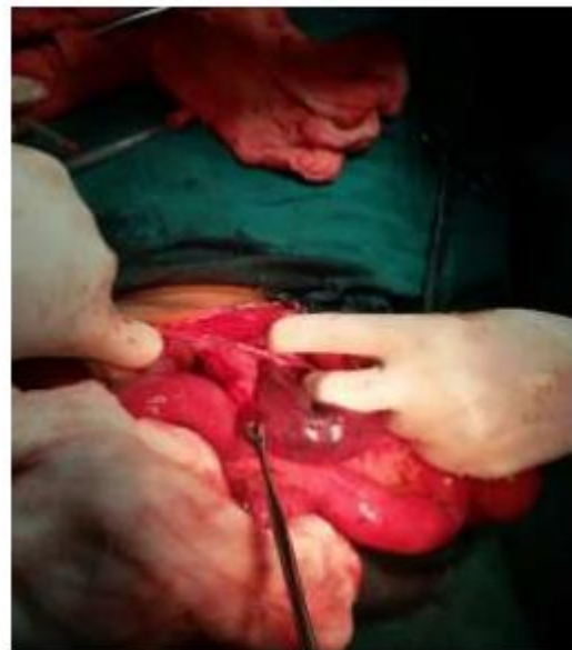
Fig-6: Intraoperative picture showing the point of twist that deliniates viable and strangulated part of meckels diverticulitis