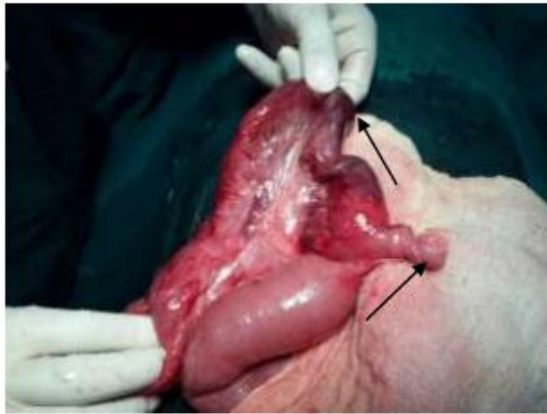
Fig-3: On complete reduction of intussusception gangrenous bowel visualised, Meckel's Diverticulum