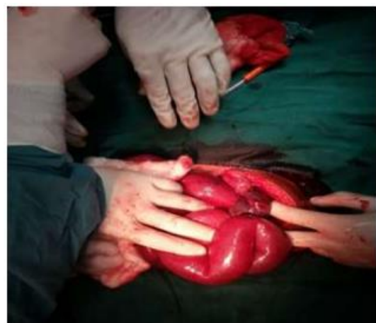
Fig-7: Intra operative picture showing excised meckels diverticulum attached to dome of urinary bladder