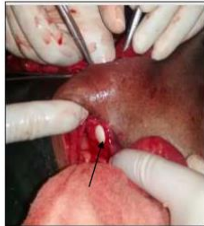
Fig-10: Defect in posterior wall