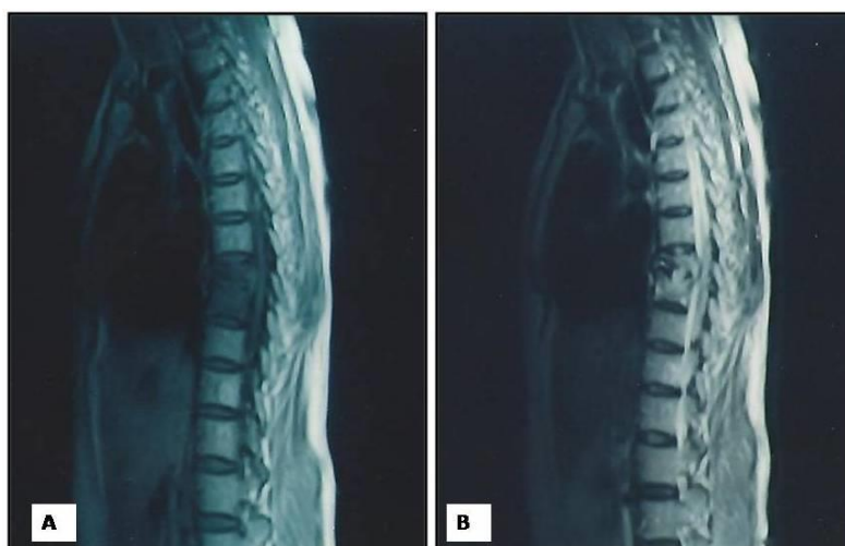
Fig 1 A and 1B -Sagittal T1W Image showing signal in D8 and D9 vertebrae with collapse of D9 vertebral body and D8-D9 intervertebral disc space. Sagittal T2W Image showing hyperintensity of the involved vertebrae and disc with anterior indentation of the thecal sac.