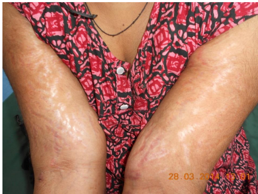
Fig 2: Extensive purplish striae