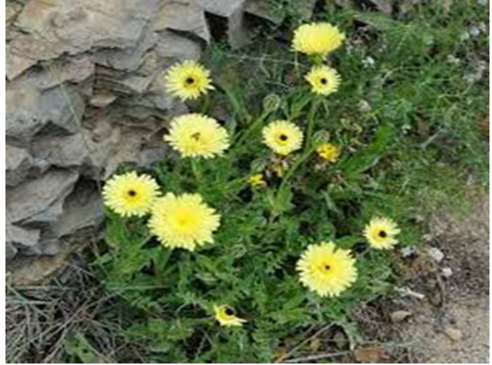
Figure 1 : Urospermum dalchampii from Amouchas region (Algeria)

allowed us to observed a diploid chromosome number with 2n = 2x = 14 (Figure 3).