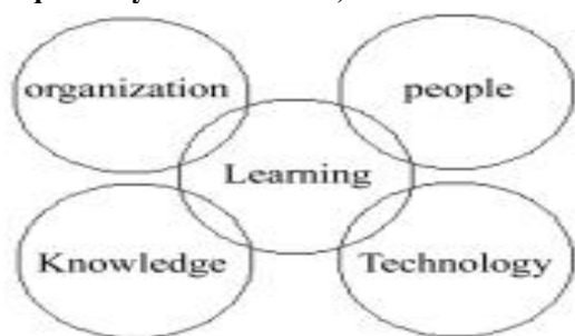
Fig. 1: Systematic Learning Organization Model

Organization, people, knowledge and technology sub-systems are needed to progress and to increase learning and each of them affect on other fourfold sub-systems. These sub-systems are needed to create and keep organizational learning and enjoyment. Fivefold sub-systems are statistically correlated to each other and complement each other. If one of these