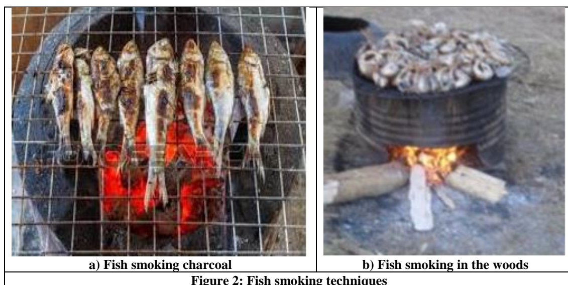
Figure 2: Fish smoking techniques

Two smoking techniques were used to reduce PCB levels: smoking with a traditional furnace using firewood as fuel and smoking on barbecue with charcoal. The charcoal used is obtained with the same wood species used for the previous smoking. The fish were smoked for 2 hours.