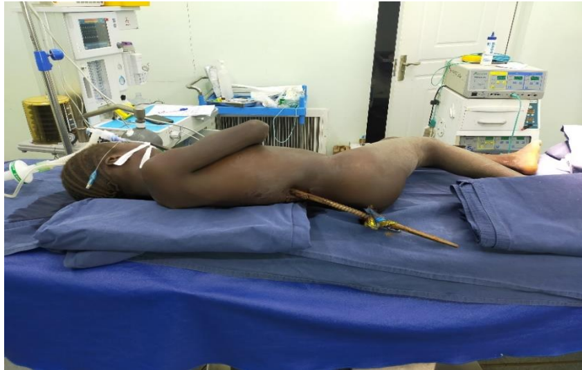
Figure 3: Installation of the patient on the operating table