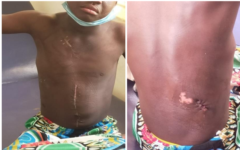
Figure 4: Post-operative scars