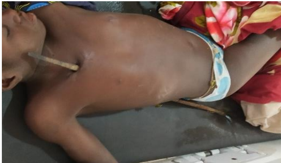
Figure 1: Thoracoabdominal impalement by iron bar

was the approach. On exploration, no intrathoracic organ lesion was observed. The gesture consisted in the extraction of the metal rod with grooming of the pleural cavity with isotonic saline, the establishment of a CH24 pleural drain, closure then dressing. As postoperative care it was injectable paracetamol 500mg/6h, ceftriaxone 500mg/12h, serum and anti-tetanus vaccine and respiratory physiotherapy. The postoperative course was simple. The patient's examination was done on D6 with unremarkable outpatient follow-up. At D15 post-operative, the wounds were well healed (Figure 4).