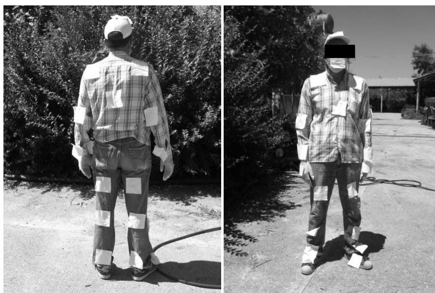
Fig-1:Patches position on operator