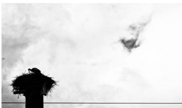
Fig-3: A Freshman artwork in Basic Photography class.

As you know, logo design is one of the main applications of graphic design. Some of the most powerful recognizable logos in the world are pictures of simplicity. The elegant appearance of these marks belies the fact that most logos require thousands of hours of brainstorming, sketching, rendering, rejecting and approving before they are launched [9]. However, simplicity is one of the structural elements of the photography. In Figure 2- we observe a black and white freshman homework for Basic Photography Course in Visual Communication Design department. Lines are often invisible connections made by the eye to different points in the picture. They often define shapes such as squares or triangles [10]. The student manages to balance his object, placed at the bottom left of the frame with a flat line.