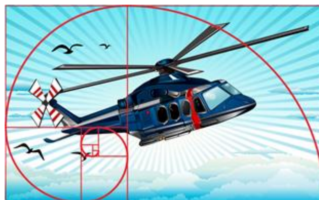
Fig-1: A student project, wherein the composition is ineffectively used.

Even though there are hundreds of examples, dozens of evidence and numerous critics for application of the golden ratio in art or design process, it may take some time for students of fine arts to perceive and apply golden ratio as a reflex. In Figure-1, we observe a sample from a Graphic Design Education-III course. We demanded from students to make a mechanical drawing that does not contain typography through pen tool in a digital environment as a project for the course. The student learns the golden ratio through its historical process along with masterpieces that go down in the history of art. The student has successfully completed his project of "Mechanical Illustration" but made a mistake that should not be done by preferring to place its illustration right in the middle of the frame rather than in golden ratio within a horizontal rectangle area.