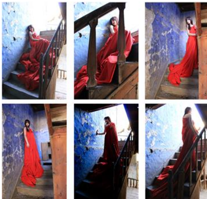
Fig-4: A sophomore project process.

The student is requested to movie poster with defined criteria and restrictions for a project in Digital Media Design course. Preferring to use photographic arrangement, the student spends time and effort by using optimum creativity for post-production. The student chooses a derelict house as a scene in a movie that he defines as "Broken Ladder". Carrying out