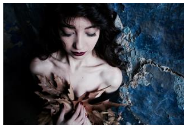
Fig-2: A student project, wherein the composition is effectively used.

In an alternative example, we observe a student project that endeavours to use composition more effectively.