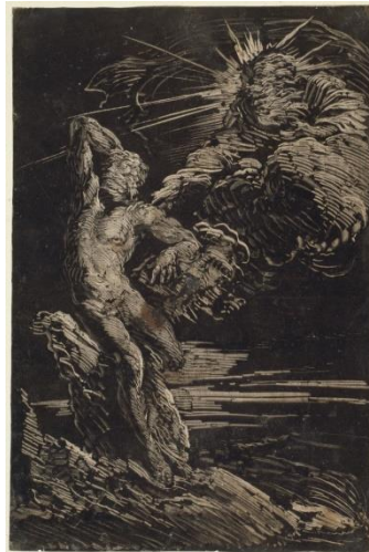
Fig-1: Giovanni Benedetto Castiglione, The Creation of Adam, Monotype Press, 30x20.5cm, 1645

well adapted to monotype printing technique. Most of his canvas paintings were created with light colors on a dark background. Castiglione's paintings and monotype prints with dark backgrounds are largely depictions of night scenes that are illuminated by a handheld light or a mystical holy light. His extant works are mostly about religious issues. "The Creation of Adam" as an illustration was made to remind that the primal darkness in the world was enlightened by god [10].