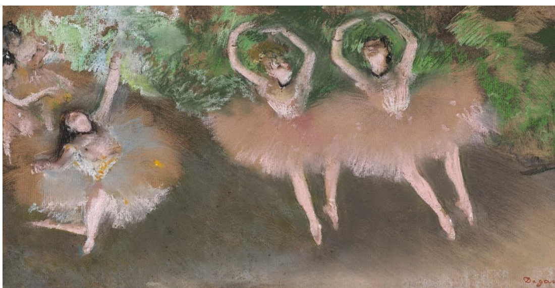
Fig-4: Edgar Degas. Ballet Scene . c. 1879. Pastel over monotype on paper, plate: 8 x 16" (20.3 x 40.6 cm). William I. Koch Collection

At the end of the 19th century, the leading artists of monotype printing were Frank Duveneck, Willam Merrit Chase, Charles A. Walker and Maurice Prendergast. The first three artists were American who