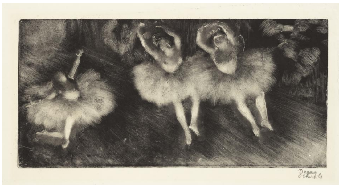
Fig-3: Edgar Degas, Ballet Scene , Monotype Press, 35,6 x 51,3 cm, 1878-80

to construct the infrastructure for lithography and pastel work in accordance with the pictorial character of his works, which are dominated by black ink, gouache and pastel paint (Fig-4) [13]. Degas also recognizes that monotypes can grasp the essence of modern life. One of the most remarkable monotypes of Degas, "A Man and a Woman's Heads," shows the faces of a couple in an amorphous way and out of focus. This gives us a chance to understand the characteristics of a person who spends everyday life in "stream of consciousness" [14].