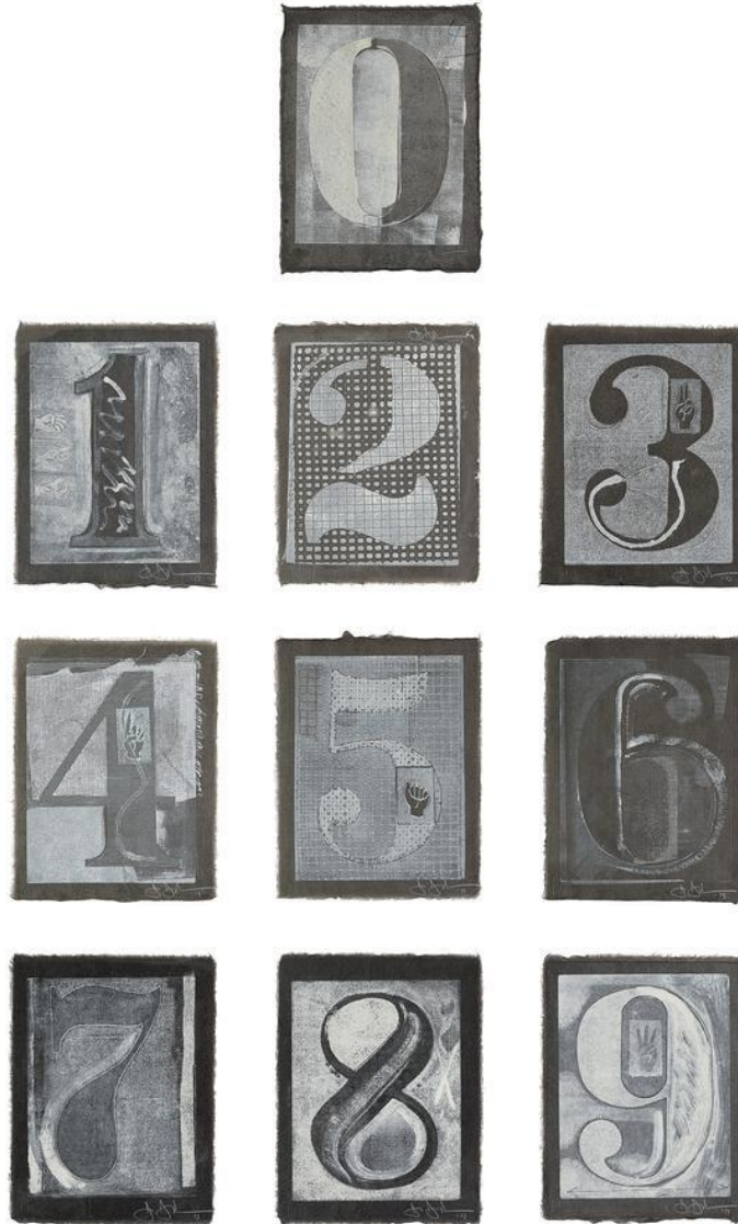
Fig-7: Print by numbers | This 2013 work by Johns, '0-9,' a monotype on hand-torn Japanese paper, will be in the upcoming show at Matthew Marks Gallery.