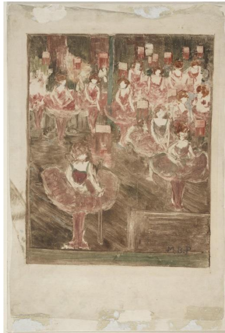
Fig-5: Maurice Prendergast. The Rehearsal. 1900. Monotype, Sheet: 14 3/4 x 10" (37.5 x 25.3 cm). The Museum of Modern Art, New York. Abby Aldrich Rockefeller Fund, 1945

Milton Avery's textured color field landscape studies. It was inevitable for these artists to choose the monotype technique to capture the mass culture, the elements of entertainment and the rush in the city [16].