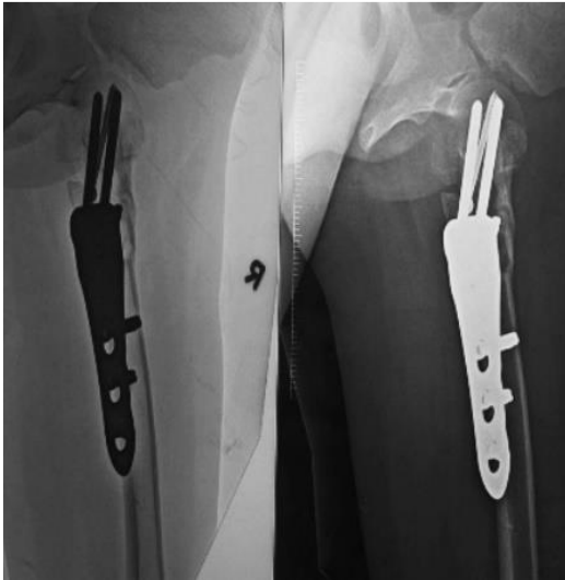
Fig 4: Post-operative X-ray at 6 weeks