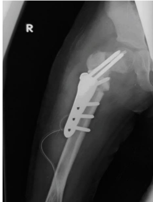
Fig 2: Immediate post-operative X-ray (A.P. view)