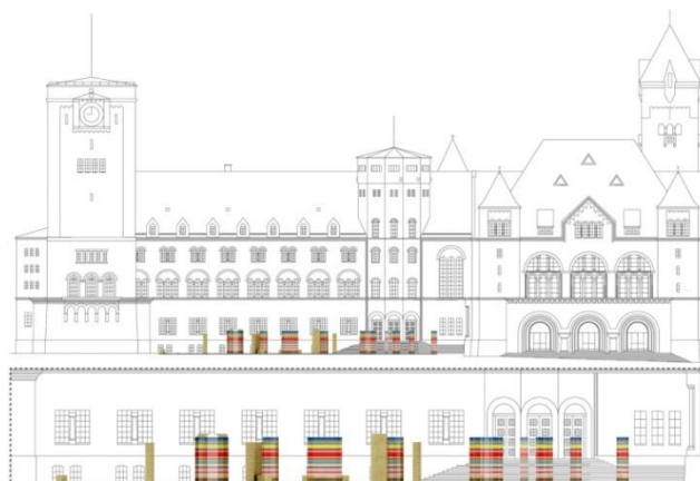
Fig-4: St. Martin Obiekton Project WE ARE SHARING CULTURE against the background of the facade of the Imperial Castle in Poznań. [Author's own]

The model is adopted on the basis of a comparative analysis of the complementarity of functions with interior furnishing and its semantic profile. The result of the compilation is either a model compensating for semantic deficiencies in the non-complementary interior or a model enhancing the existing semantic profile in the complementary interior.