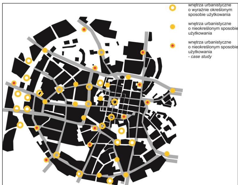
Fig-1: Identification of the focal points within city centre space of Poznan where obiektions can be implemented [author's own]