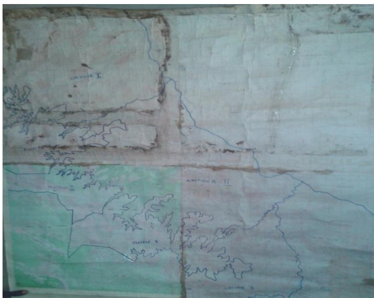
Fig-1: A Rhodesian map of Chisina – Njelele area, showing functional or jurisdiction boundaries of Chief Njelele and Headman Chisina (this is a copy which have been kept by the Gumbero Headmen since 1970s)

The Hovano agreement was a conflict resolution strategy which was done by conflicting parties. This agreement was done to thwart future disputes over boundaries. The Hovano agreement gave Chief Gumbaro all the lands on the Eastern side of the Hovano and Headman Njelele was given lands on the Western side of Hovano near the current Njelele Business centre. It can be noted that though Gumbero lost his lands he remained as a Chief and still controlled a great part of the lands as shown in the Rhodesian map below.