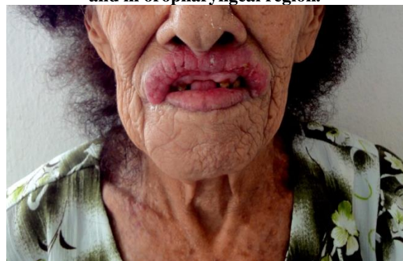
Fig-4: Clinical aspect two weeks postoperatively.