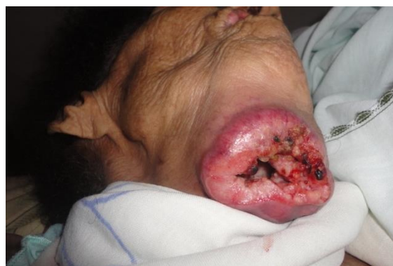
Fig-6: Ulceration and suppuration of submental lymph nodes 14 months after initial diagnosis.