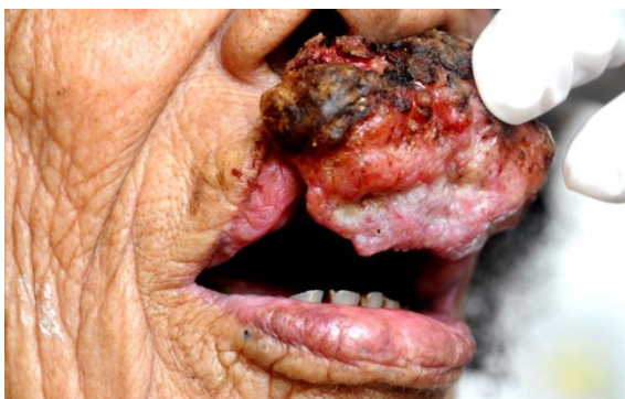
Fig-1: Initial clinical aspect of labial tumor: vegetative mucosa.

In August 2012, an infarcted left submandibular lymph node was discovered, measuring approximately 3 cm in diameter (Figure 5), with a hard consistency and painless upon palpation. In the absence of treatment, the disease progressed rapidly, with the growth of the metastasized lymph node tumor and the involvement of the submental lymph node, with ulceration and suppuration of this lymph node in November of the same year (Figure 6). The patient died in January 2013, 14 months after the initial diagnosis.