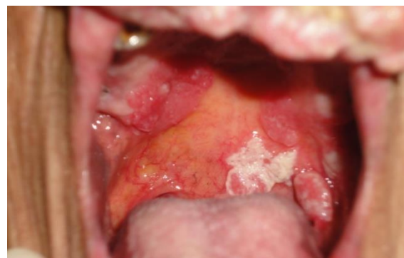
Fig-2: Initial clinical aspect of lesions on soft palate and in oropharyngeal region.