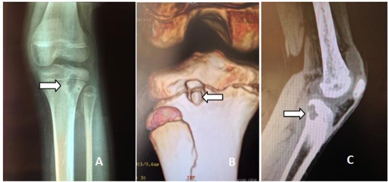
Fig.1A. The arrow indicates the lesion on plain radiograph of the left leg at the. Fig. 1B. and Fig.1C. show the CT image.