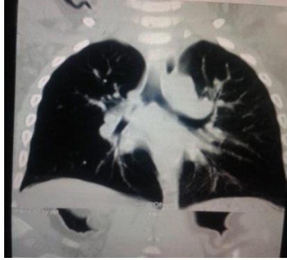
Fig-2: CT Scan showing Foreign Body in right main bronchus