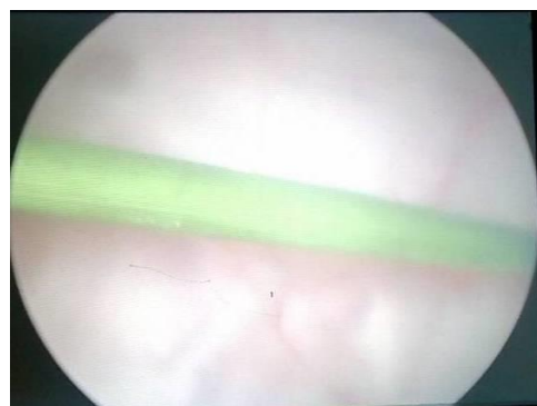
Fig.-1: Cystoscopic view of the intravesical foreign body

On cystoscopy urethra was normal. There was a long green leafy structure inside the bladder (Fig.1). With the help of stent removal forceps we removed it which was a 17 cm long rolled out bamboo leaf (Fig.2). The patient was discharged on next day. He was asymptomatic at follow-up and subsequently he was sent for psychiatric counseling.