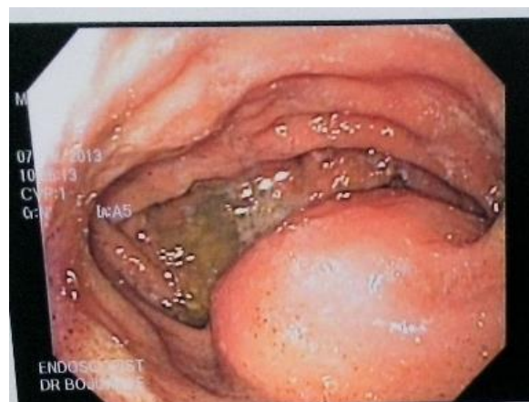
Fig- 1: Showing the endoscopic findings

Our patient was a 63 year old man who routinely attends medical outpatients' clinic of our hospital, as a known hypertensive and diabetic patient with previous history of cerebrovascular accident he suffered three years earlier and recent onset of dyspeptic like symptoms. Further evaluation of the patient was in keeping with clinical diagnosis of acid peptic disease to rule out gastric cancer. Based on the clinical diagnosis, an upper gastrointestinal endoscopy was ordered for, the result of which was in keeping with antropyloric mass with mucosa effacement over the mass (figure 1)