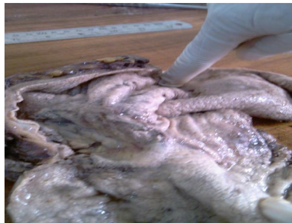
Fig-2: Showing the gross specimen of the tumour