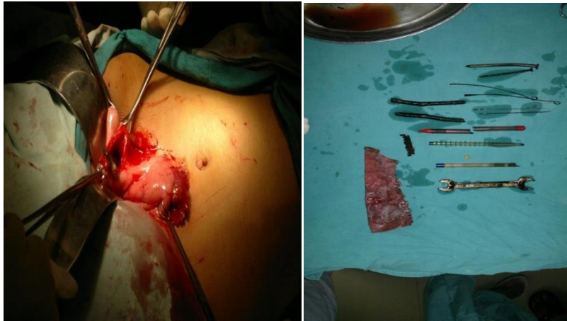
Fig-7 & 8: