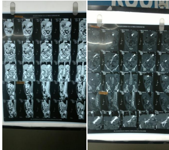
Fig-3 & 4: CT scan of the patients showing multiple foreign bodies.

However mostly foreign bodies in the GI tract are typically treated conservatively, based on the type of foreign body and the patient's clinical condition. Between 80% and 90% of foreign bodies pass through the GI tract freely, while 10% to 20% require an endoscopic intervention, and 1% require surgery. Single foreign body are mostly passed without any complications [12].