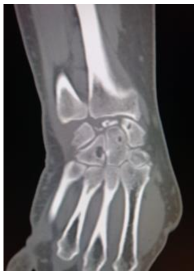
Figure 4: CT-scan of the wrist showing the fragmented and collapsed appearance of the lunate bone with subchondral cysts of the carpal bones [13]