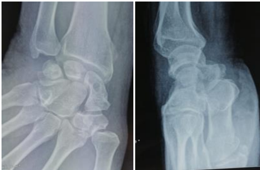
Figure 3: Frontal and lateral radiographs of the wrist showing a collapse of the lunate bone with some spots of increased density [13]