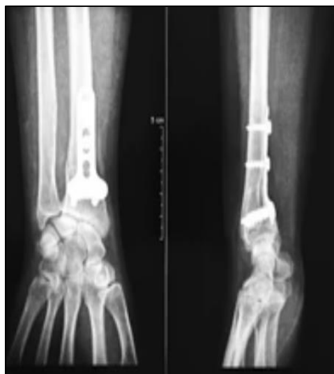
Figure 8: Follow-up radiographs after radius shortening and T-plate fixation [13]