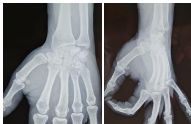
Figure 1: Radiographs showing inhomogeneous condensations of the lunate bone [13]

Radius shortening osteotomy was performed in all our patients. No postoperative complications were noted. The evolution was successful with regression of pain and restoration of joint amplitudes and grip strength, allowing all our patients to regain their normal activity. As for radiological images, they remained unchanged in 9 of our cases with only one case showing improvement.