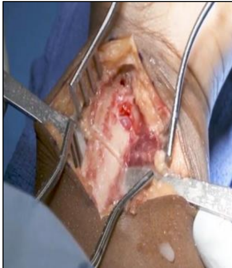
Figure 6: Image illustrating the radius shortening osteotomy [13]