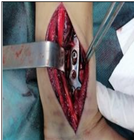
Figure 7: Image showing the placing of a T-plate after a radius shortening osteotomy has been performed [13]