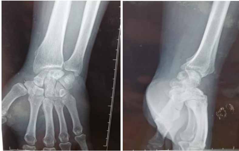
Figure 2: Frontal and lateral radiographs of the right wrist showing inhomogeneous condensation with a few geodes of the lunate bone [13]