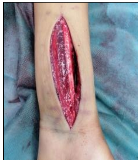
Figure 5: Image illustrating Henry anterior approach [13]

Patients were operated on under general anesthesia, in the dorsal position and with a pneumatic tourniquet on the upper arm root. After swabbing the surgical site and applying a sterile drape, the distal part of the radius was exposed via an anterior approach, passing between the flexor carpi radialis muscle and the radial artery (figure 5). The diaphysis was then exposed with the help of a rugine over a length of at least 10 cm, followed by a 4-mm osteotomy directed at an angle of 45° to the longitudinal axis of the diaphysis (figure 6), and then a fixation with a T-plate (figure 7 and 8). A posterior splint was applied. Postoperatively, all our patients received antibiotic prophylaxis for 48 hours in addition to analgesic treatment. Immobilization was maintained for two weeks, and then a well-defined rehabilitation program was prescribed.