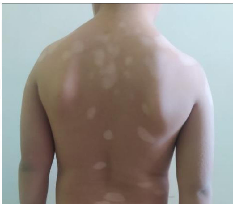
Figure 1: Patient A with vitiligo

toxoplasmosis) and autoimmune markers (AAN, rheumatoid factor, anti-ANCA, anti-dsDNA, HLA-B27, and HLA-B51) were all negative. In addition to a standard converting enzyme. The diagnosis of VKHS was hypothesized based on clinical, laboratory, and imaging evidence. This is an incomplete type of VKH syndrome. Methylprednisolone (1g/1.73m 2 /day) was administered intravenously, Begun on the third day and continued for three days followed by oral prednisolone therapy (2 mg/kg/day) and was associated to methotrexate (15 mg/m 2 every week). Following 60 days of therapy, further examinations revealed clinical improvement and the disappearance of signs of bilateral uveitis. Methotrexate is administered for two years, and oral corticosteroid medication was continued for 6 months with progressive decrease. Following the withdrawal of steroids, he demonstrated a recidive of his hyalite. We gave him full- dose corticosteroid medication as well as azathioprine (2mg/kg/day). Adalimumab (20mg/kg/day) biotherapy was considered.