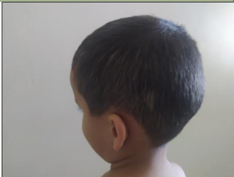
Figure 2: Patient A with poliosis