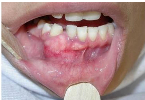
Fig 2: intraoral examination; oral mass in the anterior side of the lower jaw