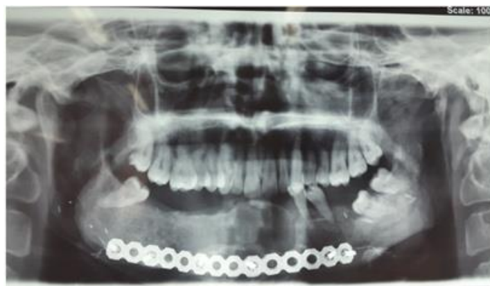
Fig 6: partial mandibulectomy and reconstruction with femoral free flap