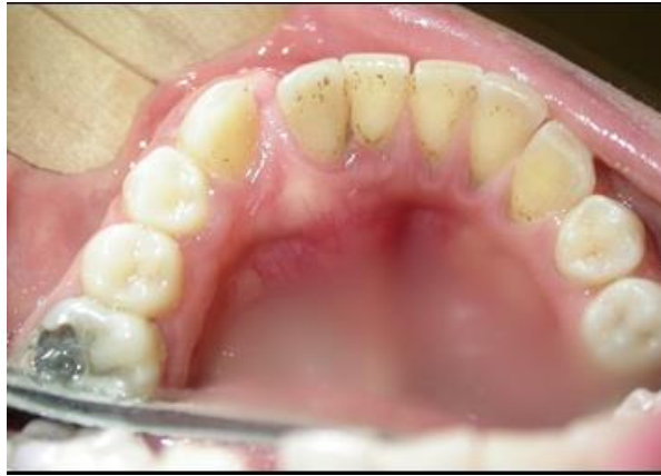
Fig 3: intraoral examination; Lingual aspect