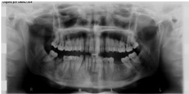
Fig 4: Panoramic view reveals mixed lesion with ill-defined border