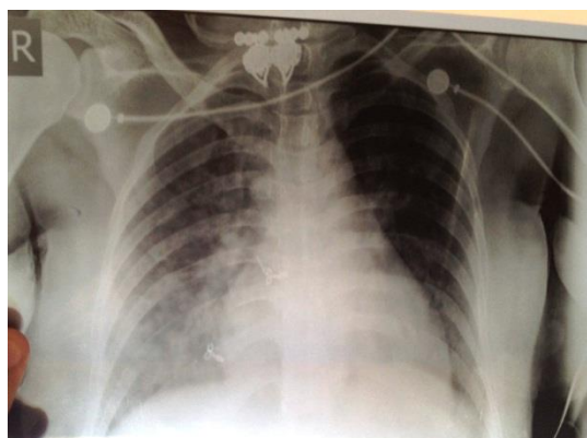
Fig-2: Chest radiographs(using an abdominal shield ) showed mild cardiomegaly with pulmonary edema