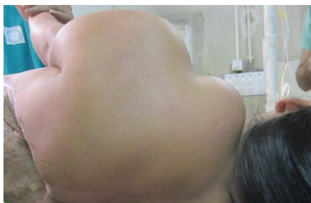
Fig 8: Recurrent shoulder mass (1 yr following operation)