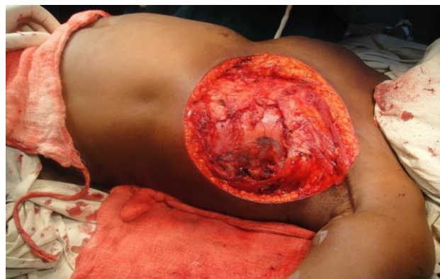
Fig 5: Chest wall defect created after wide local excision and resection of ribs.