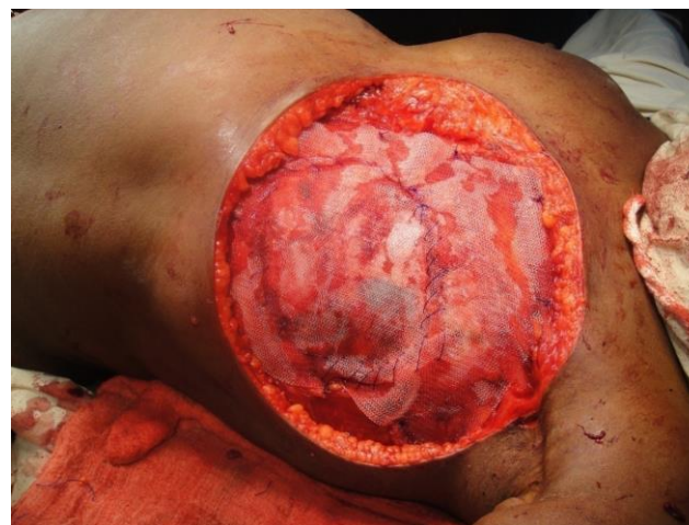
Fig 6: Chest wall defect being covered by polypropylene mesh.