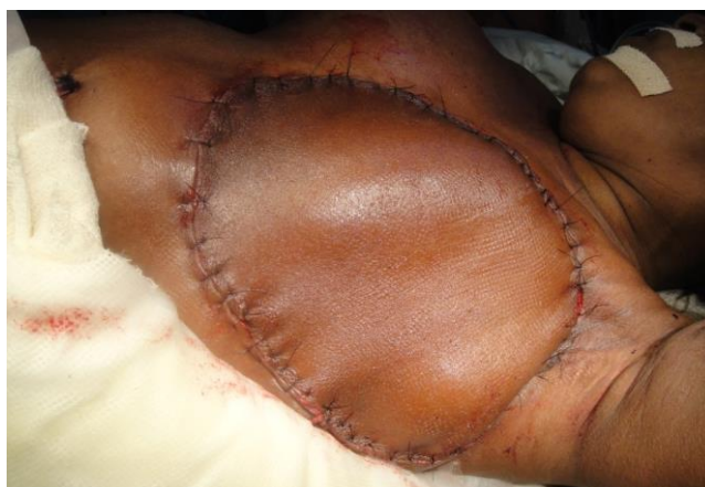
Fig 7: Chest wall being reconstructed by Latissimus Dorsi flap.