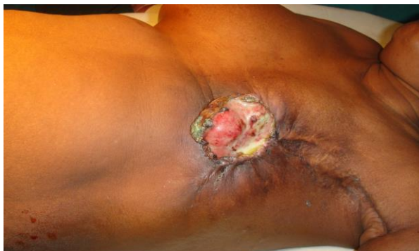
Fig 1: Supine profile of the patient showing ulceroproliferative lesion over lower part of left chest wall.

Unfortunately, she has again presented with a recurrent mass over the shoulder, 1 year following operation and core needle biopsy has diagnosed it to be malignant phyllodes.