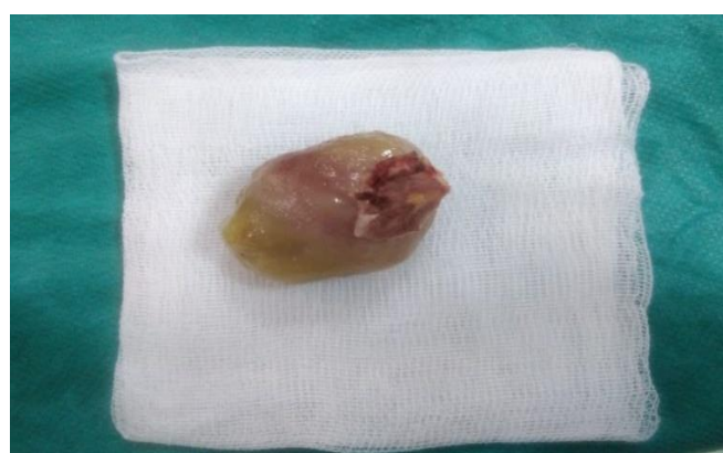
Figure 2: Operatory piece of myxoma mensuration 5*4*3.5 cm