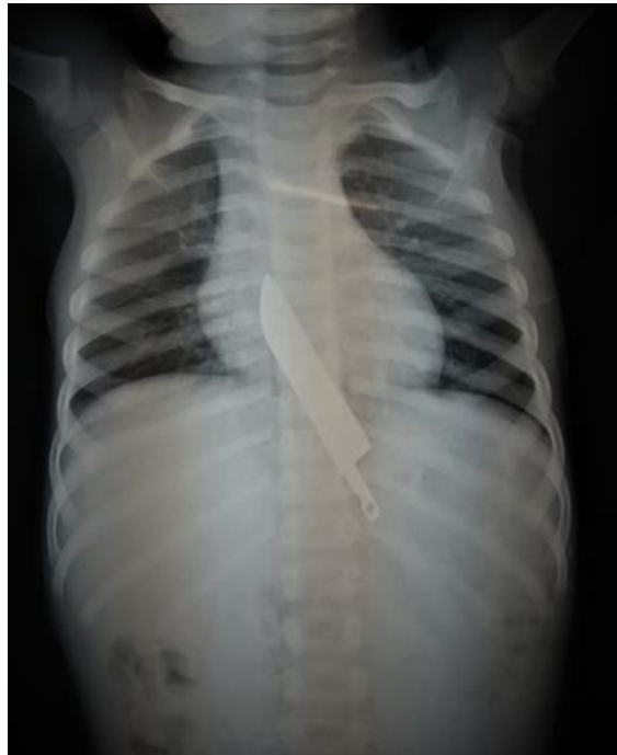
Figure 1: Plain abdominal x-ray showing the metal part of the knife in the esophago-gastric junction

A plain abdominal x-ray (figure 1) confirmed the presence of a foreign body at the esophago-gastric junction, which was identified as the metal part of the knife.