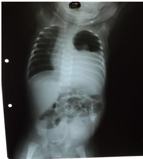
Fig-1: Hydropneumothorax of left side