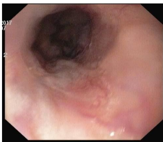
Fig 2: Follow up endoscopy after 3 weeks showed reduced varices to Grade III to Grade I