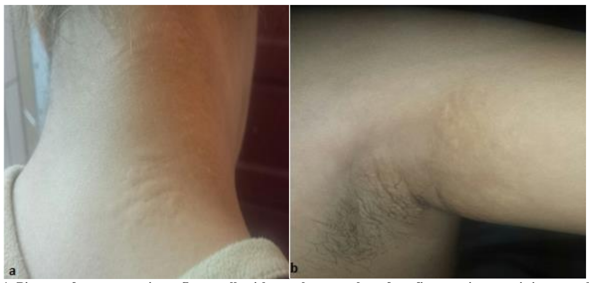
Fig-1: Picture, of asymptomatic confluent yellowish papules, smooth surface, firm consistency, sitting at neck (a) and underarms (b)