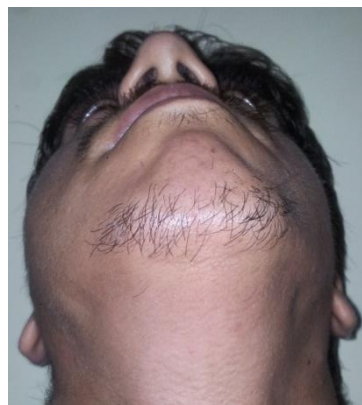
Fig-2: deviation of chin to the left side