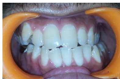
Fig-3: showing midline shift towards left and posterior crossbite