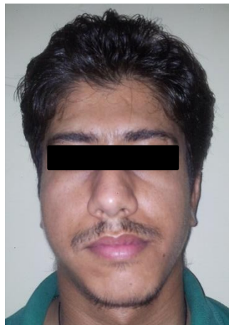
Fig-1: facial asymmetry with elongated right side of the face.

In our case, the suggested plan of treatment was high condylectomy of the right condyle followed by a postsurgical orthodontic correction.