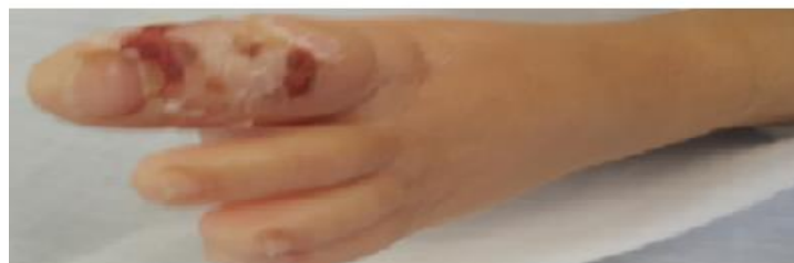
Fig-3: signs of biting on fingers and toes.