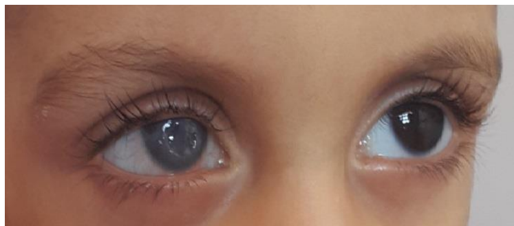
Fig-1: central corneal ulcer on the right eye