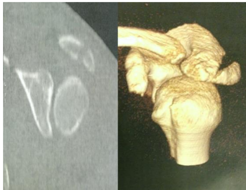
Fig-2: CT Scan shows displaced fracture of posterior angle of acromion process.