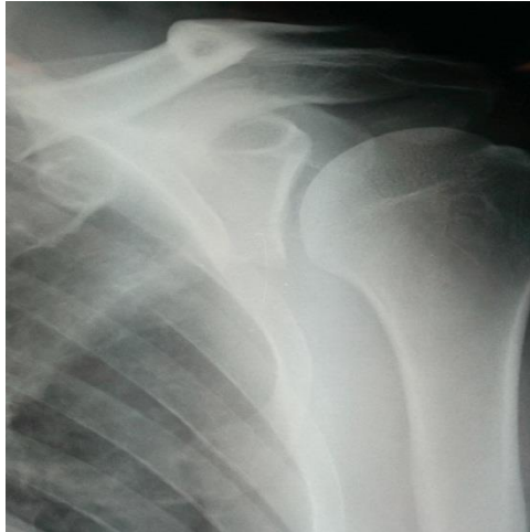
Fig-1: Preoperative shoulder x-ray.