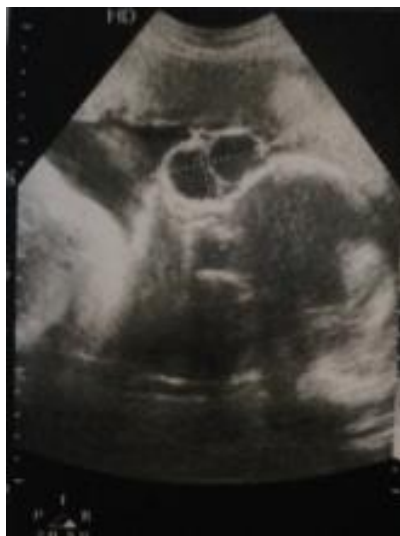
Fig-1: Ultrasound appearance of the cystic formation next to the root of the nose

nose as well as a shortened chin and low implanted ears. The newborn is declared dead after 15 minutes of life (fig 4).