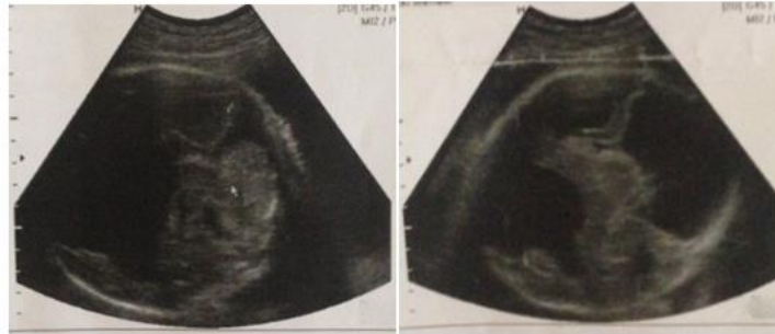
Fig-5: alobar holoprosencephaly (HPE), the most severe form of HPE. Characterized by an enlarged midline monoventricle (holoventricle) with fusion of the frontal lobes and the midline gray matter structures

level a cervix erased at 30% and dilated at 2 cm. The presentation was cephalic and the membranes were intact. Obstetrical ultrasound demonstrated a hydramnios with a Chamberlain index at 11 cm, as well as signs of alveolar HPE, namely a microcranium, a single ventricular cavity and a thalamus fusion (Figure 5). The fasting glucose level was 1.58 g / l. The serologies of toxoplasmosis and rubella showed residual immunity.