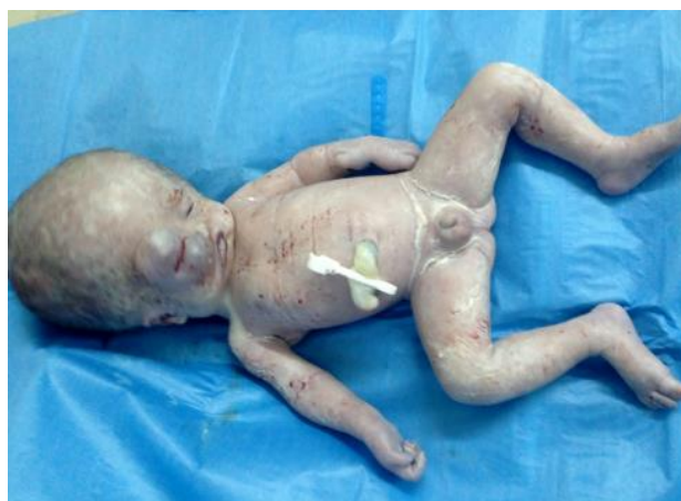
Fig-4: facial malformations