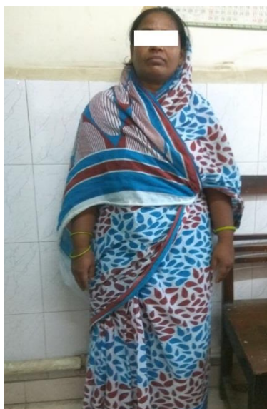
Fig 1 : Shows normal physical stature in a patient of MRKH Syndrome with situs inversus totalis.

On hormonal assay FSH, LH, prolactin & thyroid function tests are within normal limits. Ultrasonography revealed a left sided liver and gall bladder, Common bile duct, portal vein with a right sided spleen. No definite uterus like structure noted behind urinary bladder. Ovaries like structures seen in both sides of pelvis. Right sided renal agenesis noted. Karyotyping shows 46XX, determining the diagnosis of Mayer-Rokitansky-Kuster-Hauser syndrome type II (MURCS). On laparoscopic examination bilateral healthy ovaries present along with part of fallopian tube, round ligament and mullerian tubercle (Fig 3). No uterus cervix or vaginal orifice seen. Patient wants surgical correction of vagina (neovaginoplasty).