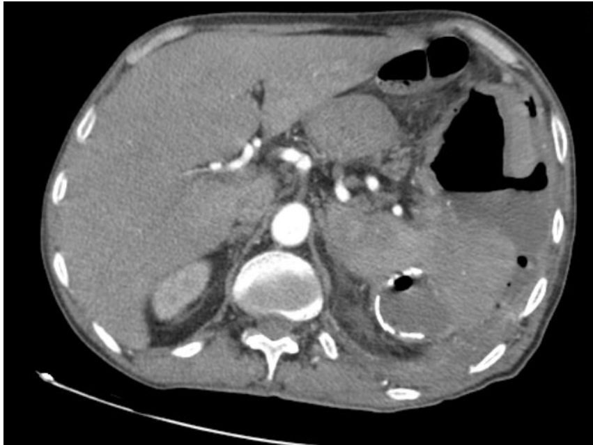
Figure 1: Axial contrast-enhanced CT image: Splenic hydatid cyst rupture; free air-fluid labeling seen within the cyst and peritoneal cavity