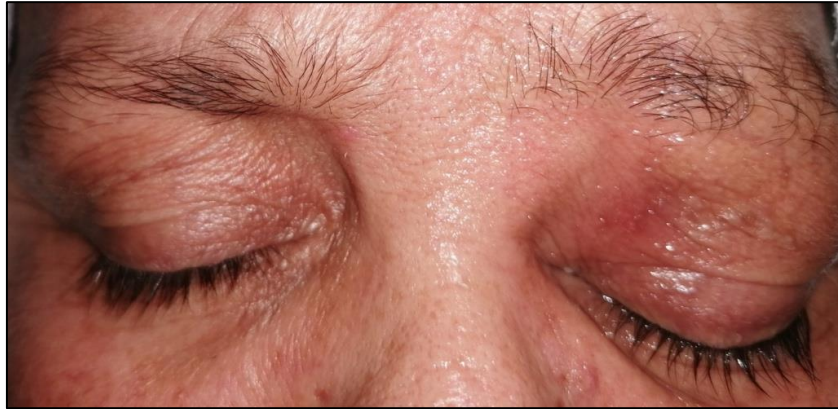
Figure 1: Left exophthalmos in the 56 year old patient

process extended to the canthus, fairly well limited measuring 40x30x16 mm, heterogeneous signal, hyposignal T1, hypersignal T2, The lesion was heterogeneously enhanced after injection of the PDC and contained areas of T1 hypersignal that did not fade on the Fatsat sequence and areas of empty T2 signal (hemorrhagic foci or phleboliths) (Figure 2).