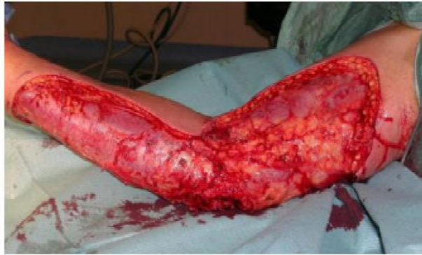
Fig. 7: Necrotizing bacterial dermo-hypodermatitis (DHBN) of the limb upper right: surgical excision