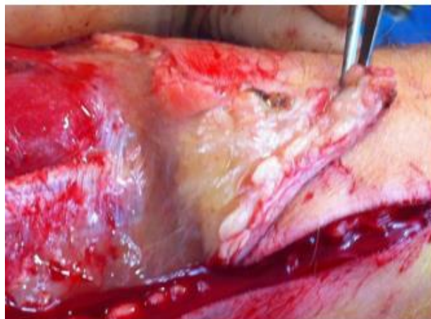
Fig. 2: Superficial aponeurosis aspect during excision, the muscle is healthy