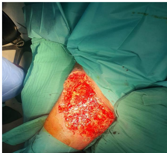
Fig. 6: Necrotizing fasciitis of the antero-medial portion of the thigh after debridement