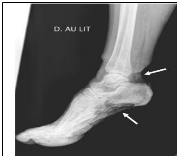
Fig. 3: Standard X-ray of a right foot showing the presence of gas