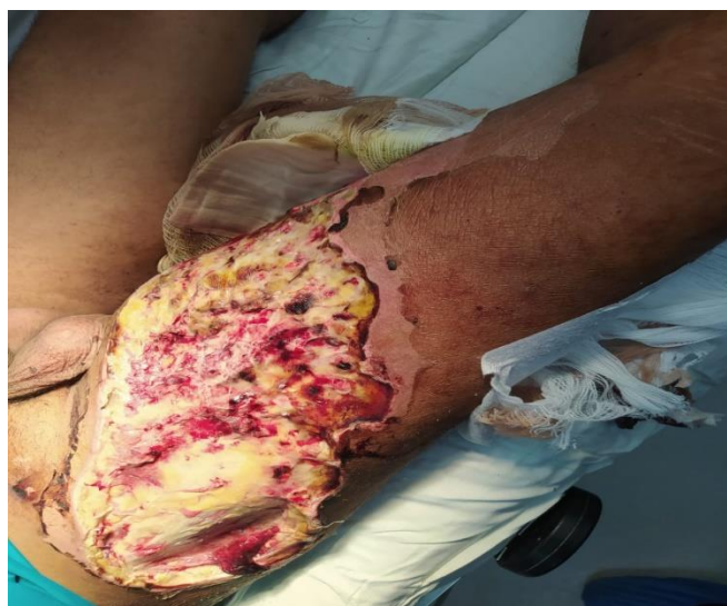
Fig. 5: Necrotizing fasciitis of the antero-medial portion of the thigh