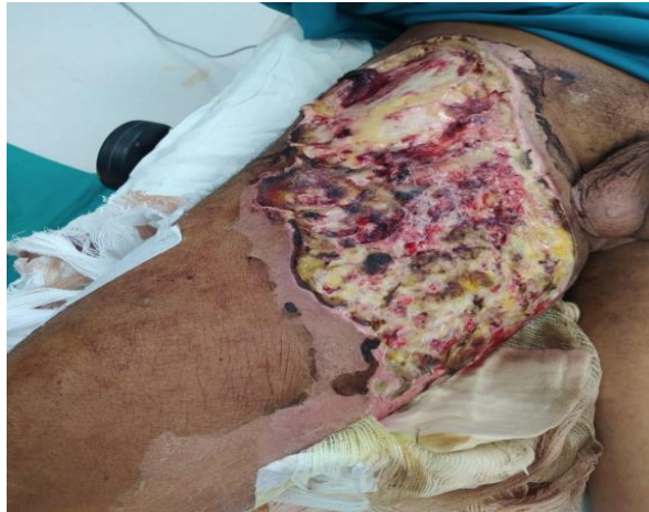
Fig. 4: Necrotizing fasciitis of the antero-medial portion of the thigh