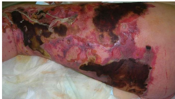
Fig. 8: Necrotic patches of the thigh