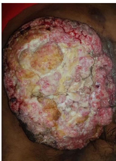
Fig-4: Evolution after 6 months: Ulcero-budding tumor with fibrinous surface taking the entire left buttock