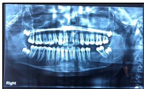
Fig-5: OPG Pan: Shows radiopacity involving entire maxillary sinus of the left side