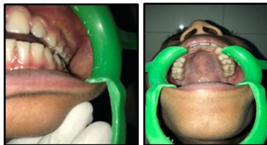
Fig-3 and 4: Intraoral examination findings