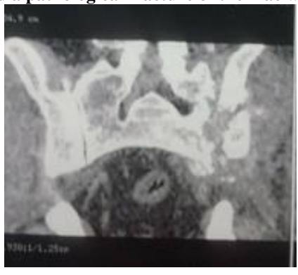
Fig-2: TDM: the bone remodeling with destruction and an articular enlargement